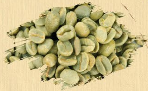
Robusta S18 Clean