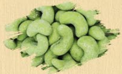
Wasabi Roasted Cashew Nuts