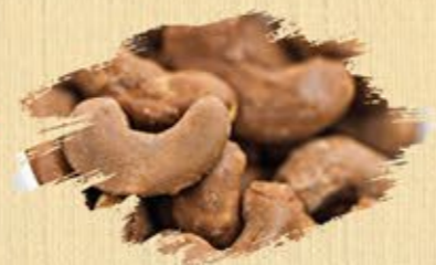
Cappuccino Flavored Cashew Nuts