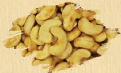
Spicy Garlic Flavored Cashew Nuts