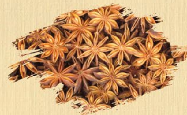
Whole Star Anise (Standard)