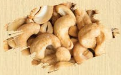
Salted Roasted Cashew Nuts Without skin