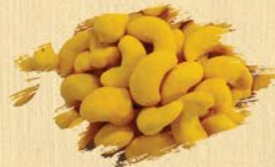
Cheese Roasted Cashew Nuts