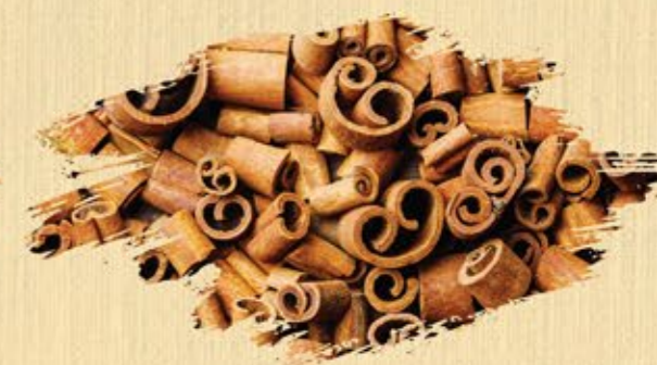
Round Cut Cassia