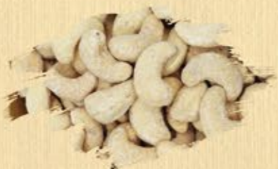
Coconuts Milk Coated Cashew Nuts