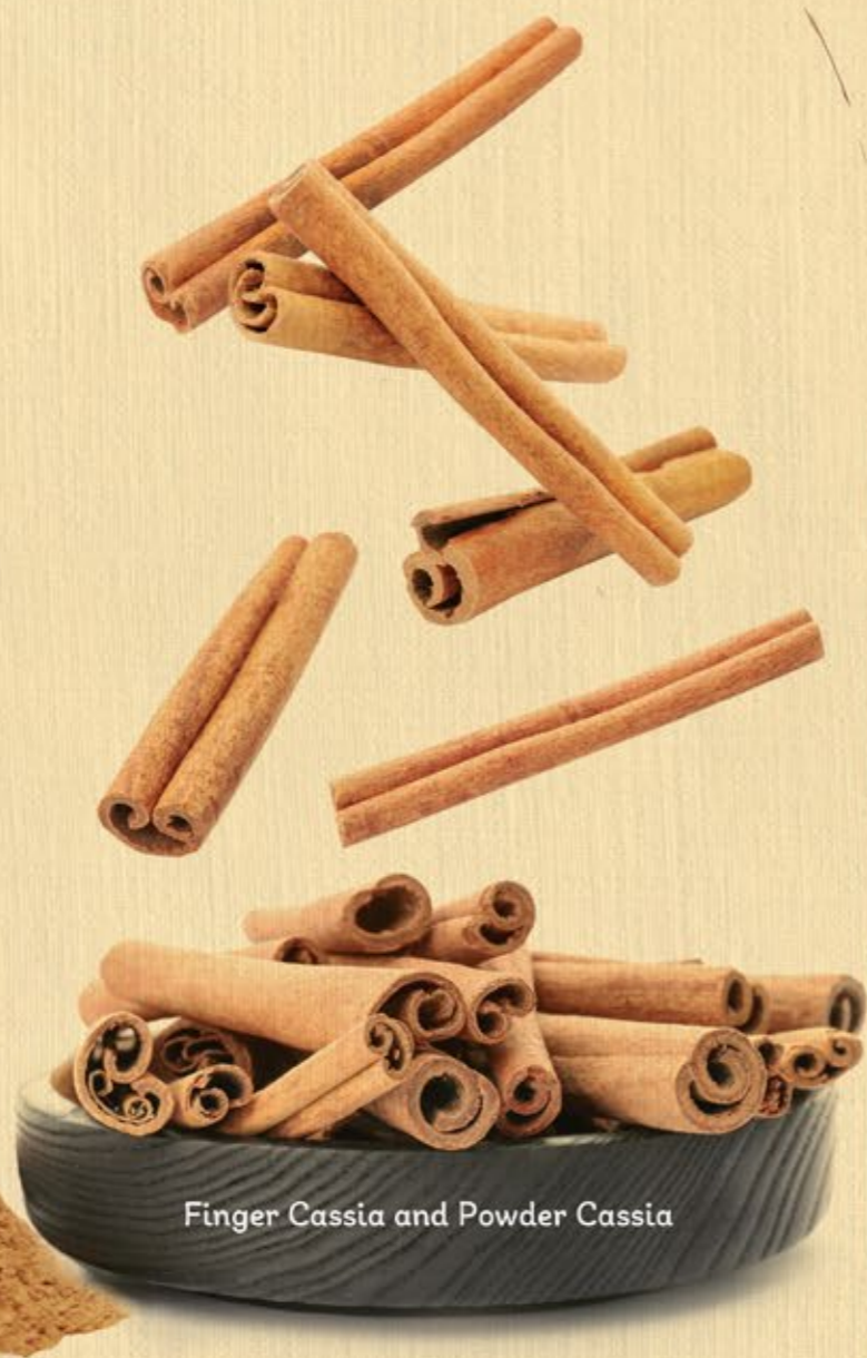
Finger Cassia and Powder Cassia