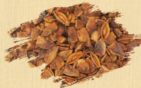
Broken Star Anise