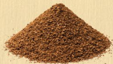
Tea bag cut cassia