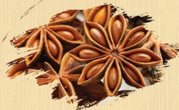
Whole Star Anise (Superior)