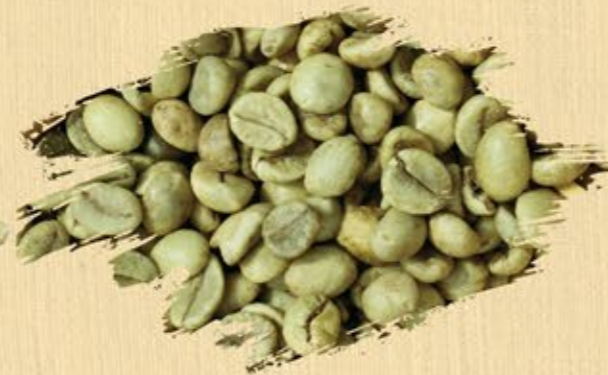
Robusta S18 Standard