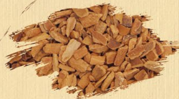
Broken Cassia KABC