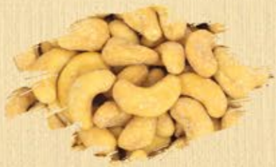
Honey Coated Cashew Nuts