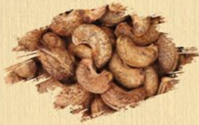
Salted Roasted Cashew Nuts With Skin