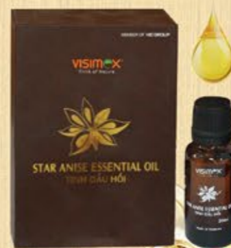
Star Anise Oil