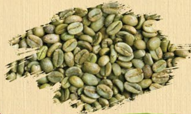
Robusta S18 Standard