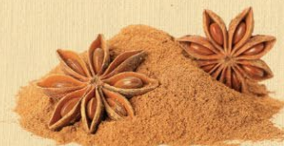
Star Anise Powder