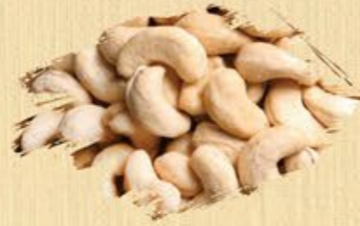
Original Flavor Roasted Cashew Nuts