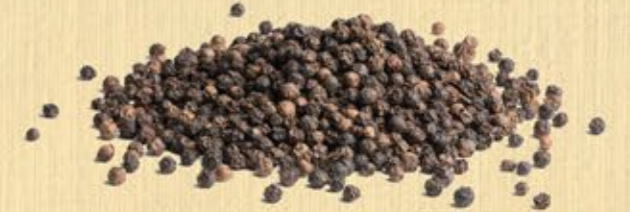
Black Pepper 570 gr/l ASTA clean

Black Pepper Steam Sterilized & ASTA quality