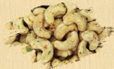
Cashew Nuts With Lemon Leaves