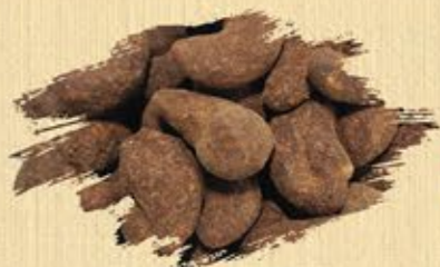
Chocolate Flavored Cashew Nuts