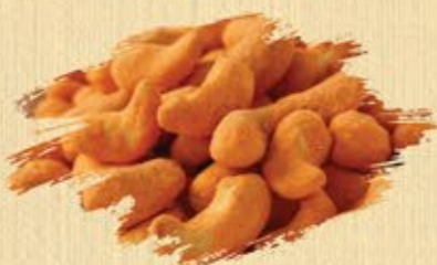
Salted Egg Flavored Cashew Nuts