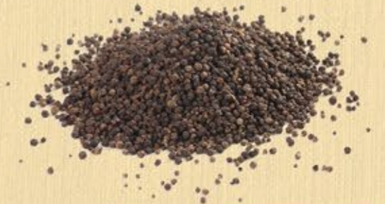
Black Pepper 500 gr/l FAQ