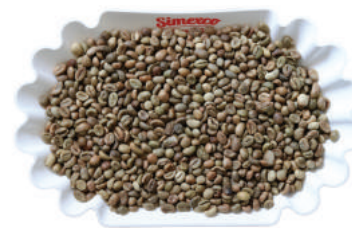
GR 2 SCR 13 CLEANED

Black & Broken: 2%max, FM: 0.5%max, Moisture: 12.5%max, SCR 16: 90%min