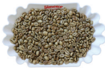
GR 1 SCR 18 WET POLISHED

Defects: 5 (CQI), Moisture: 12.0%max, SCR 15/13: 90%min