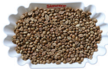
FINE NATURAL ROBUSTA

Black: 0.1%max, Broken: 0.5%max, FM: 0.1%max, Moisture: 12.5%max, SCR 18/16: 90%min