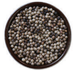
WHITE PEPPER SW

Density: 630 G/L min, FM: 0.3%max, Mixed black pepper: 3%max, Moisture: 13.5%max