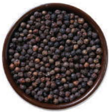
BLACK PEPPER 5MM

Density: 630 G/L min, FM: 0.3%max, Mixed black pepper: 3%max, Moisture: 13.5%max