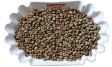
FINE HONEY ROBUSTA

Defects: 5 (CQI), Moisture: 12.0%max, SCR 15/13: 90%min