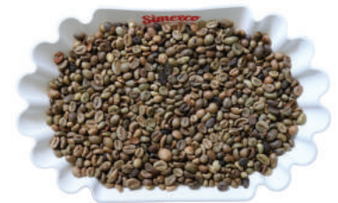
GR 2 SCR 13 STANDARD

Black: 0.1%max, Broken: 0.5%max, FM: 0.1%max, Moisture: 12.5%max, SCR 13: 90%min