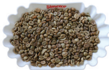
GR 1 SCR 18 CLEANED

Black: 0.1%max, Broken: 0.5%max, FM: 0.1%max, Moisture: 12.5%max, SCR 18: 90%min