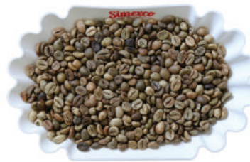
GR 1 SCR 18 STANDARD

Black: 0.1%max, Broken: 0.5%max, FM: 0.1%max, Moisture: 12.5%max, SCR 18: 90%min