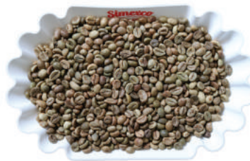
GR 1 SCR 16 CLEANED

Black: 0.1%max, Broken: 0.5%max, FM: 0.1%max, Moisture: 12.5%max, SCR 16: 90%min