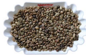
GR 1 SCR 16 STANDARD

Black: 0.1%max, Broken: 0.5%max, FM: 0.1%max, Moisture: 12.5%max, SCR 16: 90%min