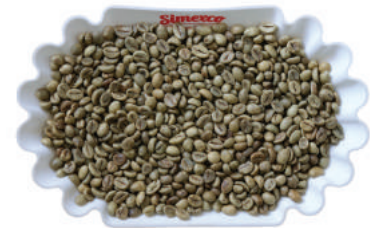
GR 1 SCR 16 WET POLISHED

Black & Broken: 2%max, FM: 0.5%max, Moisture: 12.5%max, SCR 18: 90%min